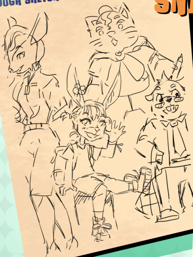
MAJOR CHARACTERS ROUGH SKETCH